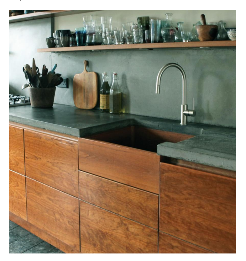
In summary this finish requires a regular maintenance regime but it is wonderfully easy to repair.

Regular application is necessary to maintain effective protection of the timber surface Limescale remover will strip oil finish back to the bare wood.